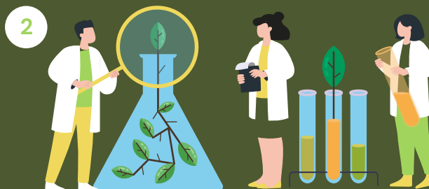
Production and testing of improved forest genetic material.