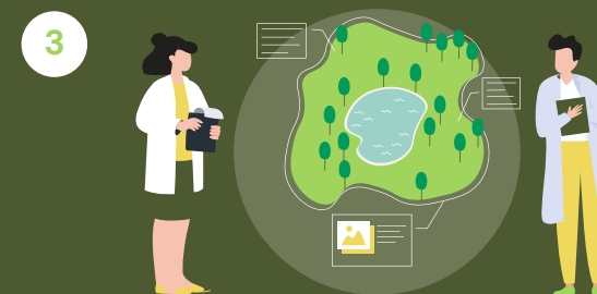
Creation of trial and demonstration plots in the forest laboratories.