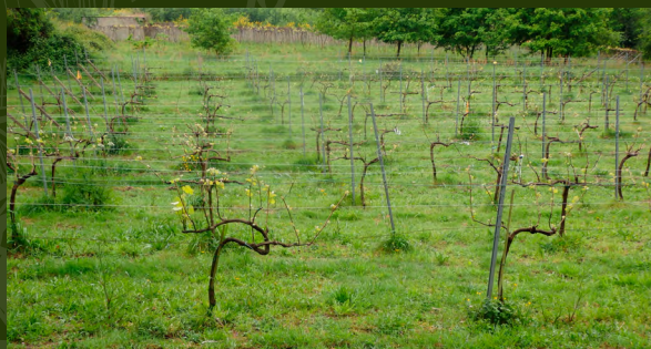
Vineyard of study in the Appellation of Origin Rías Baixas

The project develops a tool for the forecasting of possible infections which will combine: meteorological data measured at the vineyard level, prediction of the phenological stages of the vine and concentration of spores and inoculum necessary for the infection to occur. This tool will allow estimating the crop production in advance, as well as reducing antifungal treatments applied in the vineyard. Therefore, it will facilitate the work of cooperatives and wine cellars, contributing to the production of a higher quality wine and a more sustainable production by minimizing the impacts on the environment related to the application of phytosanitary products.