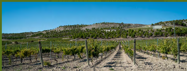
Vineyard of study in the Appellation of Origin Ribera del Duero

With the aim of maximizing the impact of the results and the transfer of the solutions to be developed in the VITICAST project, an intense dissemination work will be carried out at regional, national and European levels (articles, events, workshops, web, etc.).